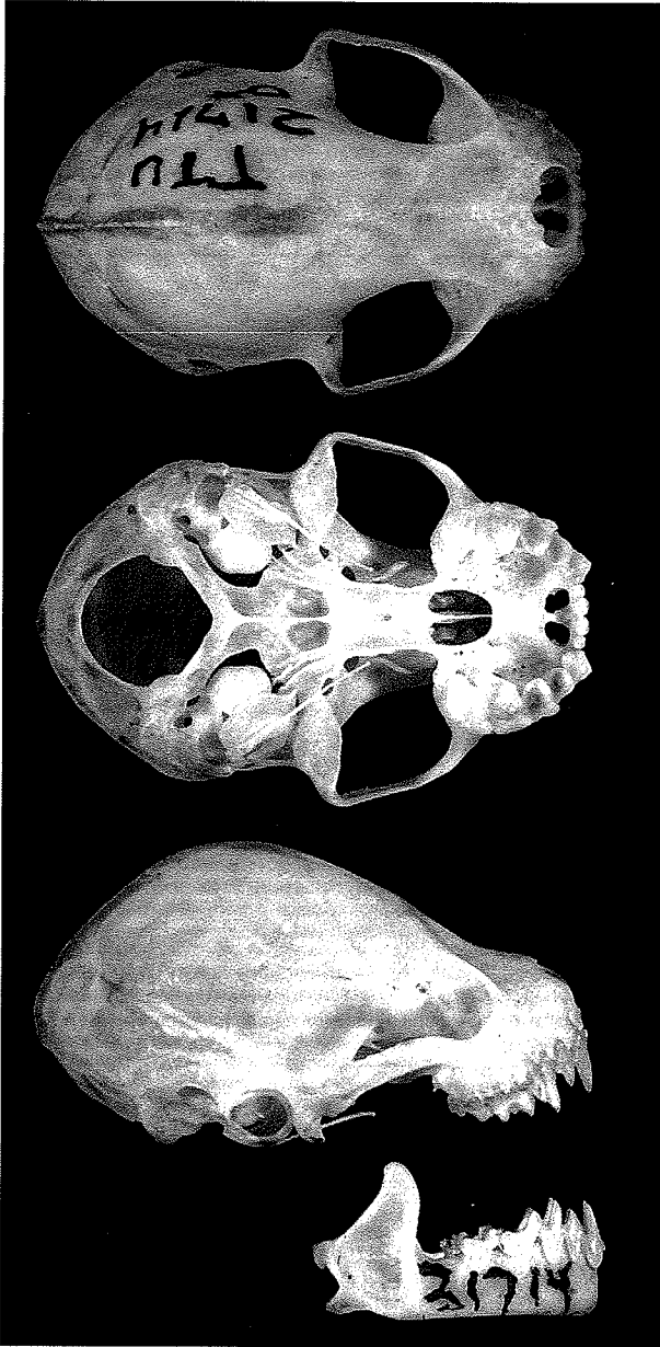
Fig. 2. Dorsal, ventral, and lateral views of cranium and lateral view of mandible of an adult male Ariteus flavescens from Jamaica, St. Ann Parish, Orange Valley (Texas Tech University [TTU] 21714). Greatest length of cranium is 19.05 mm.

acrosome, 2.83 \pm 0.23 (2.60–3.16); and length of nucleus, 3.27 \pm 0.21 (2.88–3.53).